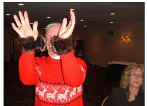
Crazy Auction raised $1660. Thanks to all who supported this famous event.